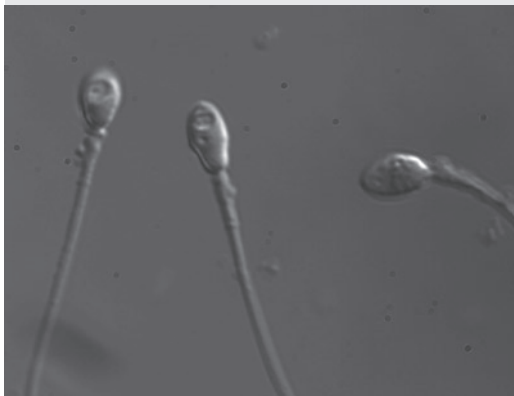
Sperm selection at high resolution (IMSI)